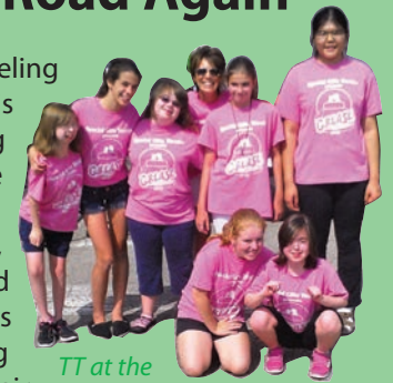
TT at the Buffalo Grove Arts Festival

The SGT Traveling Troupe (TT) is performing around the Chicagoland area! Last year, they appeared at eight venues performing several of their greatest hits and creating awareness for SGT. These are wonderful opportunities for our students and mentors to build social skills, develop stage presence and provide additional outlets for self-expression and growth!